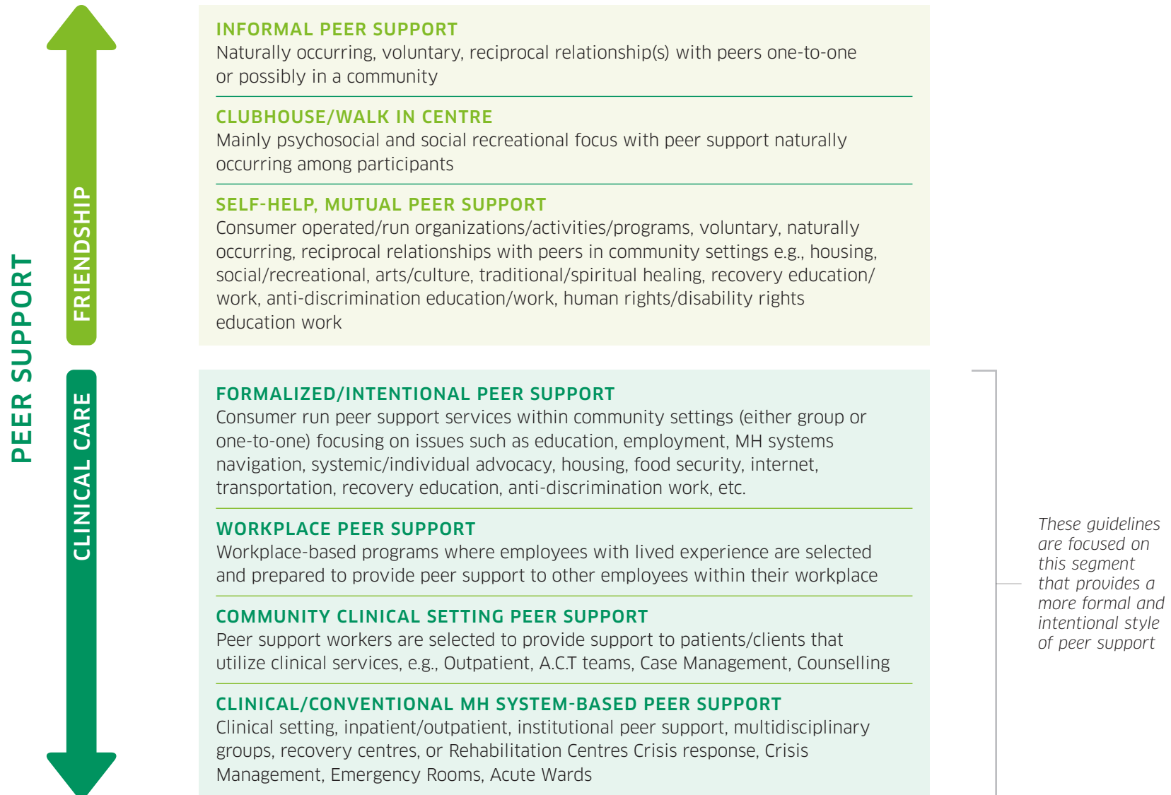
Figure 1: Spectrum of Types of Peer Support